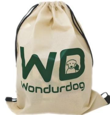
Drawstring storage bag