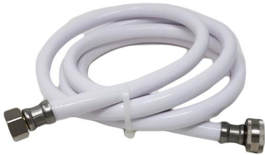
7 foot hose