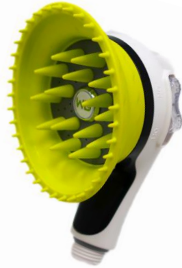
Shower brush head