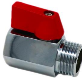
Shut off valve for shower pipe