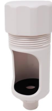
Tub spout diverter