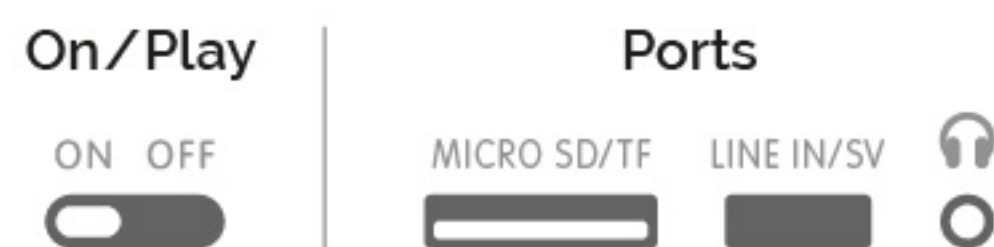
Pet Tunes for Birds SKU 7004