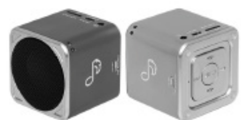
Pet Tunes for Dogs SKU 7001

Pet Acoustics' innovations have helped thousands of pets and owners worldwide, with products clinically tested and approved by veterinarians to promote pet wellness.